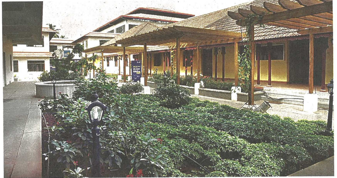
■ The Nadakkavu Government Vocational Higher Secondary School for Girls has been ranked as the No. 2 government school in the Education World (EW) India School Rankings for 2019-20.